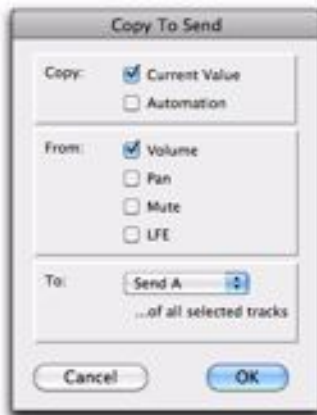
Copy to Send dialog

This command lets you copy either the current values or automation of a selected track's volume, pan, mute, or LFE automation to the corresponding playlist for the send. This is useful when you want a track's send automation to mirror automation on the track itself.